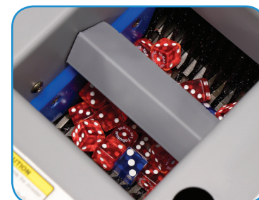
Solid steel blades shred chips, tokens, dice, cards