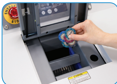
Drop chips, dice & cards into the shredding chamber