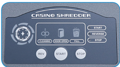
User friendly LED control panel displays real-time shredding status